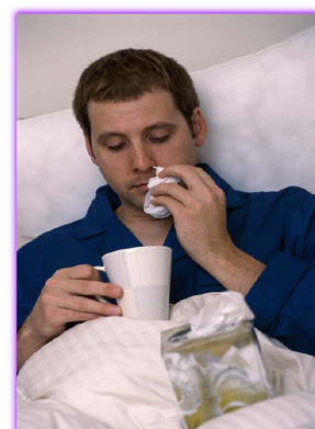
Man Flu—27 times worse than Ordinary or "Lady" Flu

common in the winter. Anyone can get flu and the more close contact a person has with people who have the virus, the more likely they are to get it.